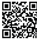
UM Campaign Donation Page

Donate Online: uwoxfordms.org/um (Credit/Debit Card, PayPal, or Apple Pay)